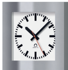
N Wall mounting