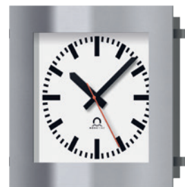
F Flush mounting